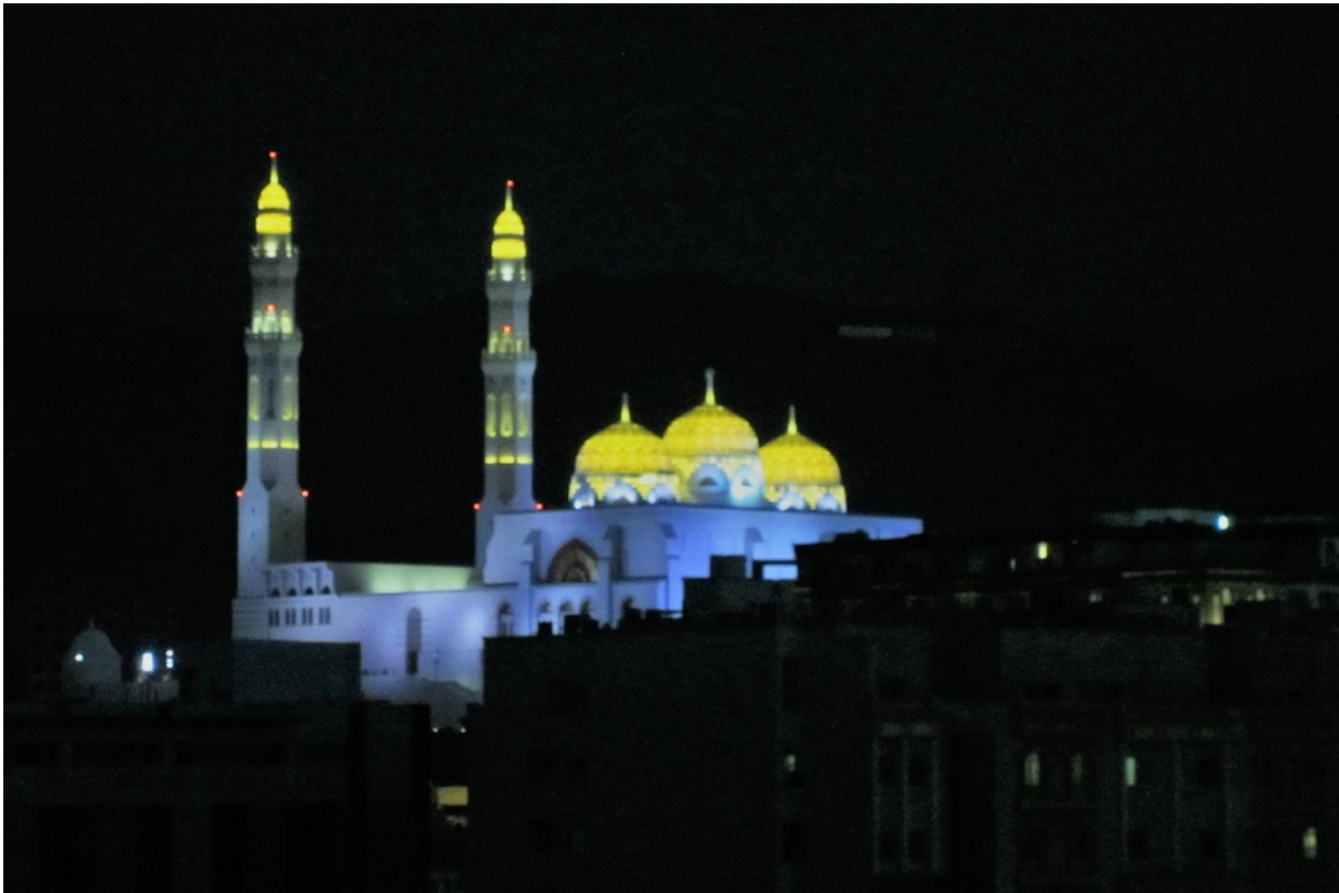
The Mohammed Al Ameen Mosque, Muscat, Oman