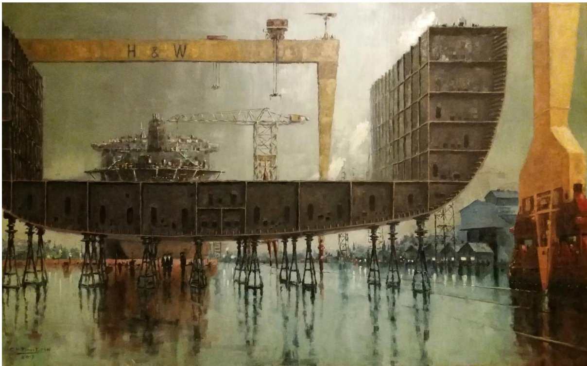
Shelter under Section -Oils on Canvas