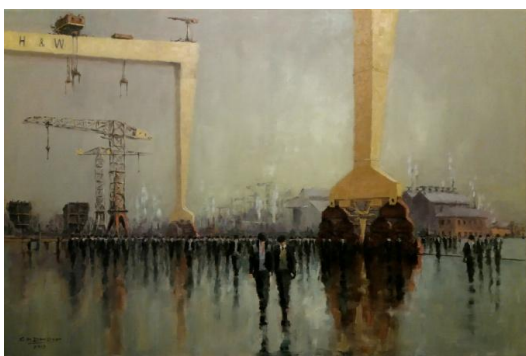
Colin paints his ship- yard scenes in oils.

That’s a difficult one to answer without sounding too cliché, being blessed with good health to paint more of the same but maybe on a much larger scale.