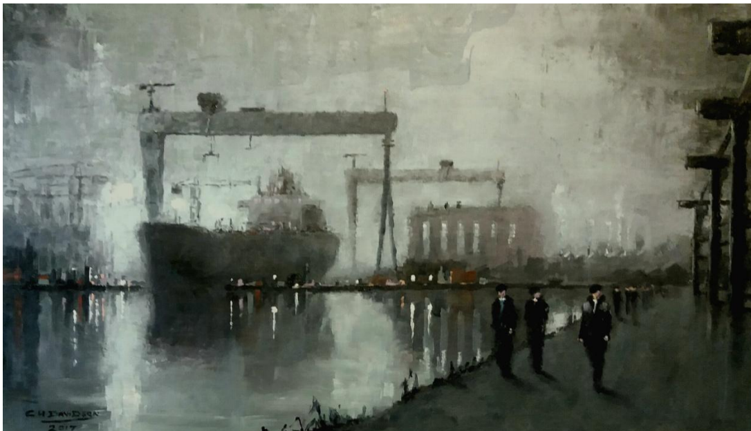
Night Shift -Oils on Canvas