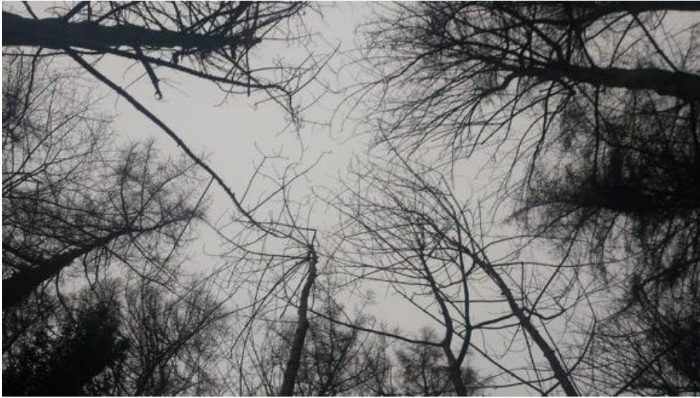
Cavehill forest park in the heart of Winter.